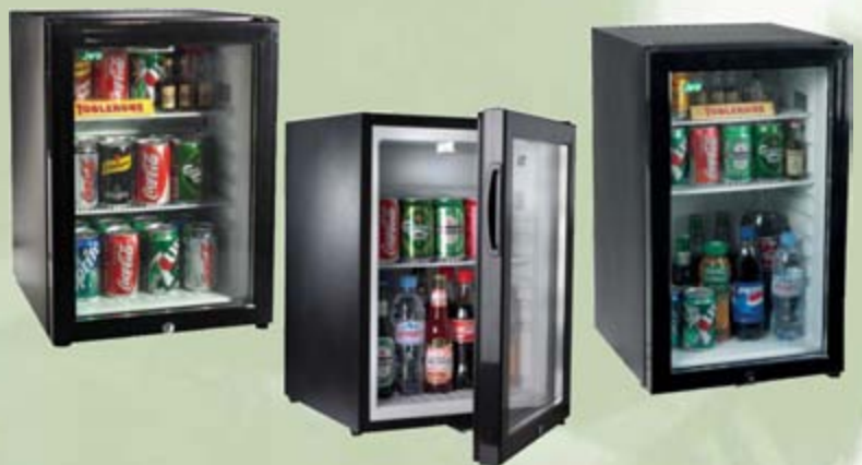
Minibar Glass Models