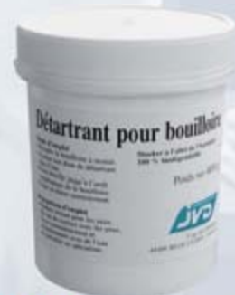
Kettle de-scaling powder